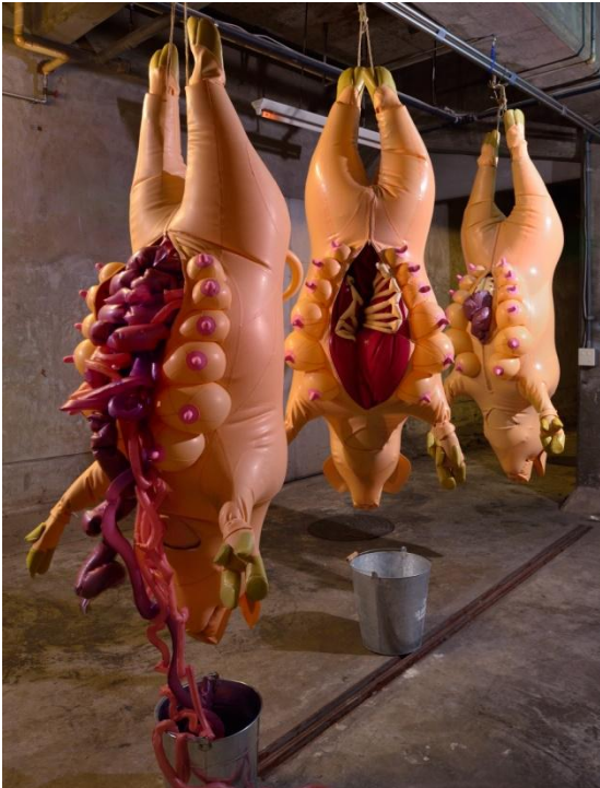
Saeborg - Slaughter house 8 – photographie