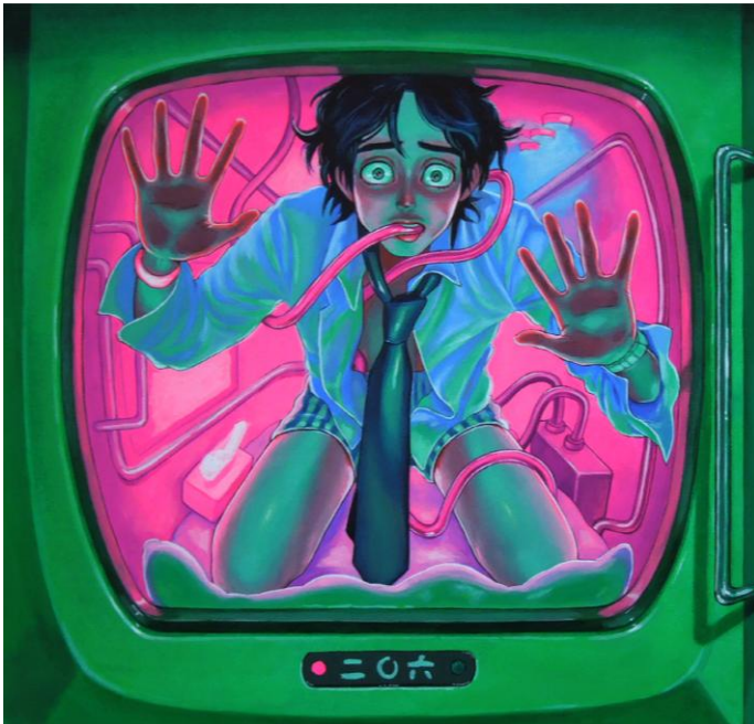
Sachiko Kaneoya – Sleeping module of doubt