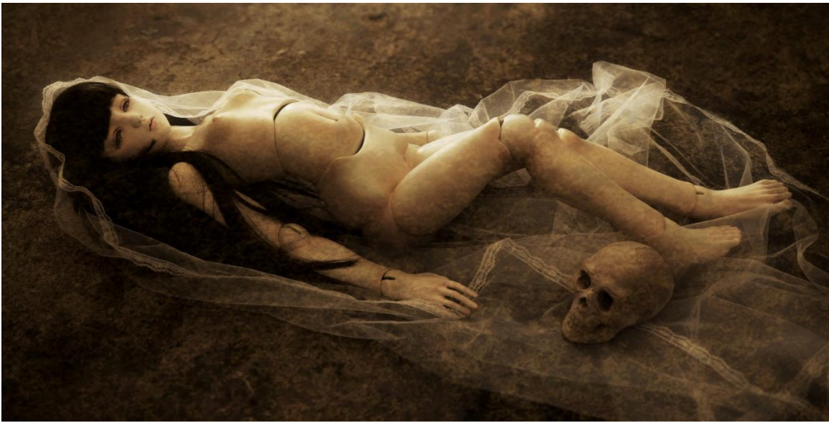
Mori Kaoru - Death and maiden – Sculpture argile/tissu