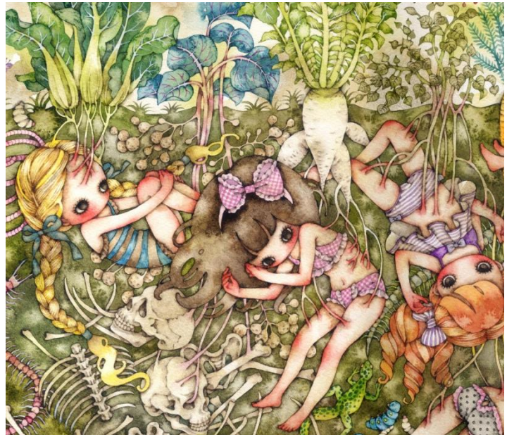
Tama - Live and let live- aquarelle